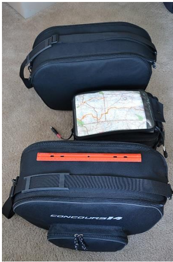
Photo of everything going on the bike except for the stuff in the top trunk (and the rider). Unless you're really into riding and/or are planning a motorcycle trip, you should probably skip this, but I've put a lot of thought into planning this trip, so I thought I'd go ahead and post it. In fact, I've thought about this so much that I drafted this from memory. Planning a trip is definitely part of the fun.

I started out using a very nice Motofizz Multi Tank Bag from Aerostich, but after my first shakedown ride, I switched back to my trusty old, rather small Cortech magnetic tank bag. The Motofizz felt like it was sitting in my lap, and I was just carrying too much stuff.